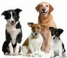
Dog Tags help us find our way home!